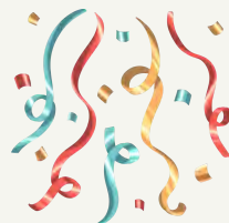
Tableau-Nanyang JC Data Storytelling Challenge