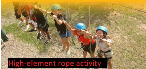
High-element rope activity